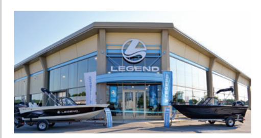
15 LEGEND BOATS WHITEFISH, ONTARIO