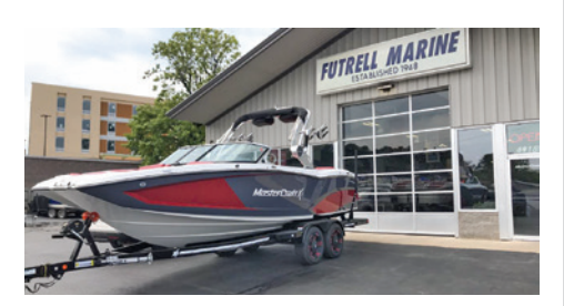
FUTRELL MARINE HOT SPRINGS, AR