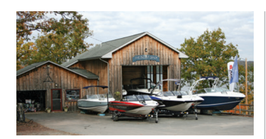
THE BOAT SHOP TAFTON, PA