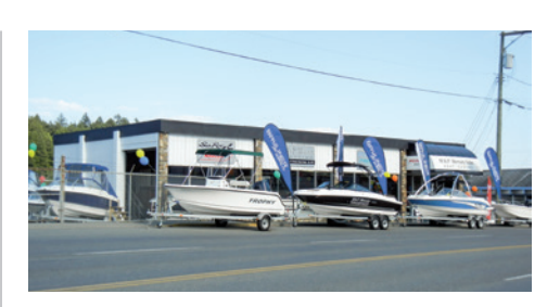
M & P MERCURY SALES LTD. BURNABY, BRITISH COLUMBIA