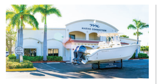
MARINE CONNECTION WEST PALM BEACH, FL