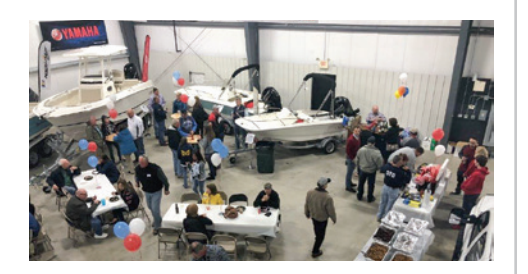
CLEMONS BOATS SANDUSKY, OH