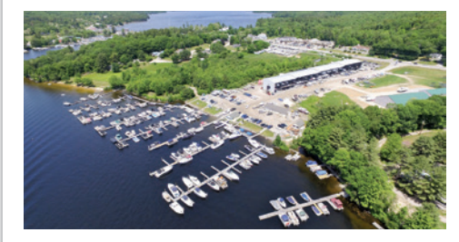
MARINA HOLDINGS LLC YARMOUTH, ME