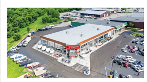
RIVER VALLEY POWER & SPORT - MARINE RED WING, MN