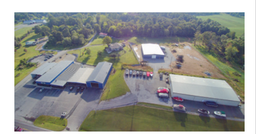
MARINE SALES GROUP, INC. MEMPHIS, TN